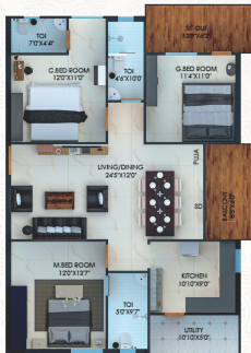
Block 01- West 1700Sq.ft