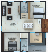
Block 01 West 1250Sq.ft