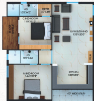
Block 02 East 1315Sq.ft