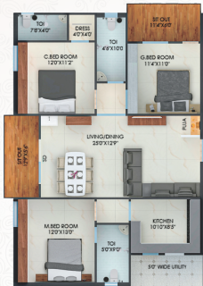
Block 02 - East 1700Sq.ft